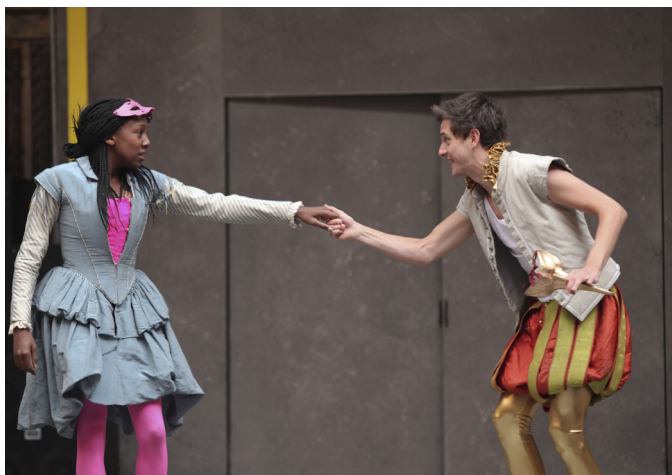
A 2013 production of Romeo and Juliet , one of Shakespeare's tragedies. Romance – both happy and sad – was a common theme for playwrights.

Comedies , on the other hand, could be relied upon for happy endings, often weddings. Shakespeare's Two Gentlemen of Verona is especially happy; it ends with two weddings! Other comedies were more satirical. Ben Jonson wrote The Alchemist to make fun of London society.